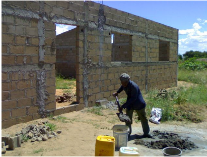
Catembe UMC Chapel