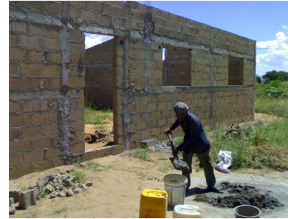
Catembe UMC Chapel