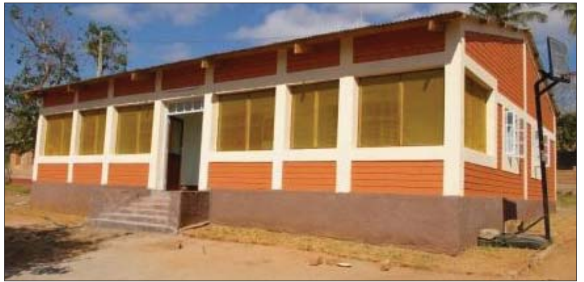
These pictures show the new learning center at the Carolyn Belshe orphanage.