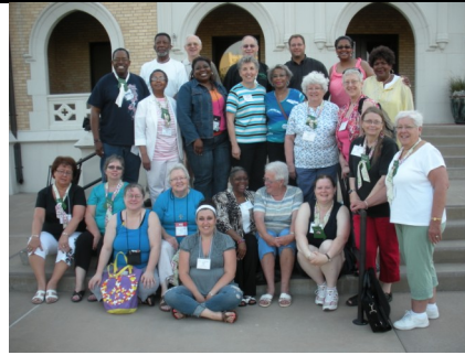
Here is the awesome Missouri Conference UMW team!