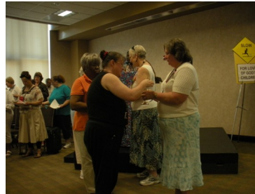
Communion being shared among sisters.